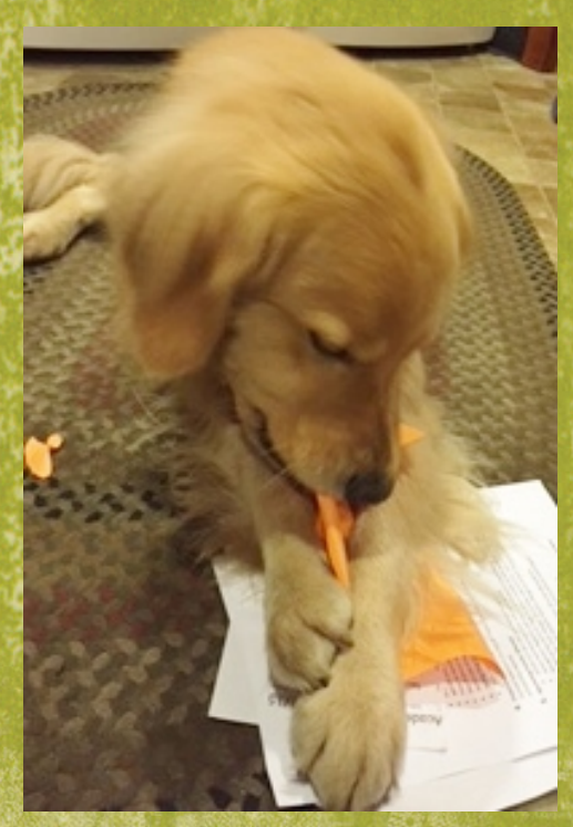
PHOEBE ENJOYS TASTE TESTING THE DOG TAG SHAPE BALLOTS: