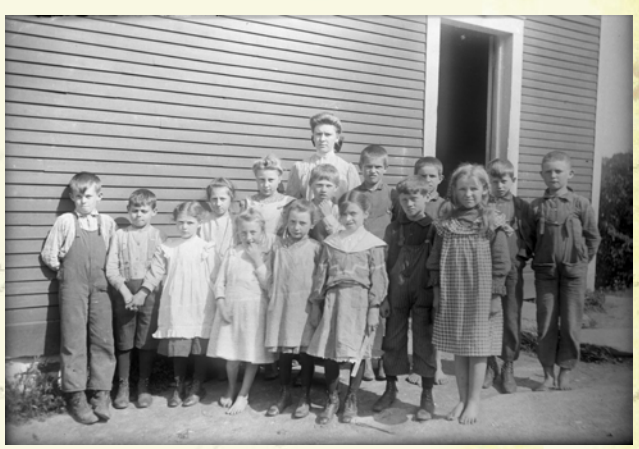
Photographer: Homer Locke, circa 1910 "Ida Lancor's School"