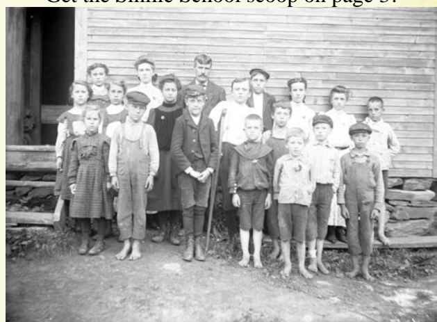
circa 1910 "Barrett's #3 School"